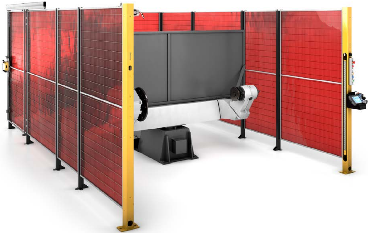
Representative design of a standard robotic welding cell

Pre-engineered robotic welding systems from Lincoln Electric Automation™, including the Fab-Pak™ XHS, can enhance part production by improving productivity, quality and safety. The Fab-Pak XHS standard robotic welding cell is a two zone with a center or rear mounted robot on an H-Frame positioner. The H-Frame positioner will rotate 180 degrees to allow single load/unload access point. Each zone contains a headstock which is used for reorientation of small to medium sized parts. It allows more welding to be done with a smaller arm and in a smaller overall system footprint.